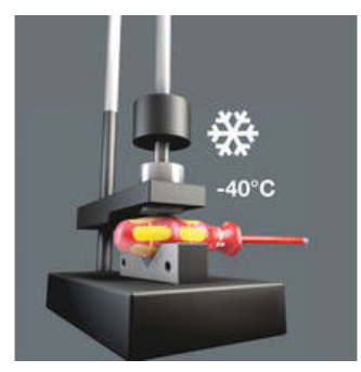
Impact strength tested at -40^{\circ} C, guaranteeing safety even under extreme conditions.