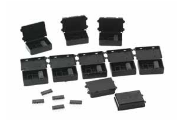
3M™ Single Device Carrier 5701

All dimensions are referenced from the inside bottom of the container and are nominal dimensions.