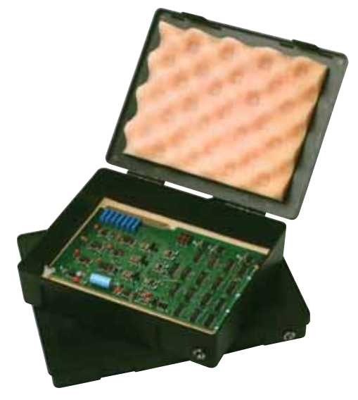
3M™ Single Card Carrier

Conductive Containers are ideal for static-safe storage, kitting, and in-process handling and transporting of static-sensitive assemblies and devices. Made from injection-molded plastic, these containers are noncorrosive and lightweight. Static-sensitive devices can be transported in these containers which provide protection from static discharge and from static fields.